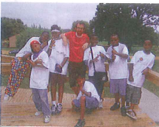
"Looney Tunes" cabin mates kickin' it with Jeff

Congratulations to the 2008 champions, Ballerz. Camp ended with our annual Final Performance on July 17. Campers showcased all of their hard work from classes in dance, step, vocal music, percussion, poetry, marital arts, and rap. Without a doubt this was the best Camp of Dreams yet...but just wait until next year.